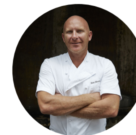
MATT MORAN CHISWICK, SYDNEY

“FOR ME, GREAT FOOD IS ALL ABOUT SIMPLICITY, SEASONALITY AND LETTING QUALITY INGREDIENTS SHINE.