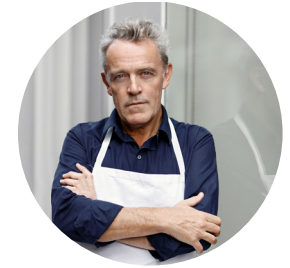
ALAIN PASSARD L'ARPÈGE, PARIS

“FANTASY, MAGIC, GARDEN GENIUS. NATURE HAS WRITTEN THE MOST BEAUTIFUL COOKBOOK. FOR ME, THE SEASONS ARE RENDEZ-VOUS!