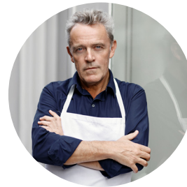
ALAIN PASSARD L'ARPÈGE, PARIS